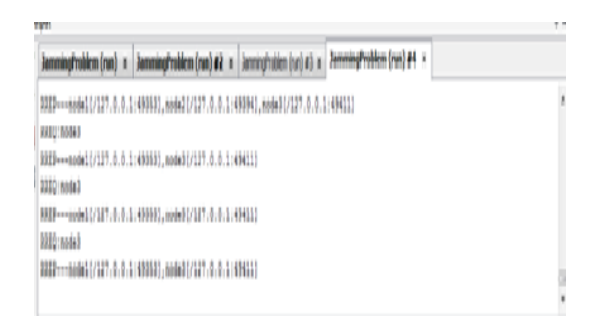
Figure 2: Jamming attack description with attacker node(using Rrep-Ack Rerr,Rrep,Rreq).

Sticking is not a transmit-just movement. It requires a capability to recognize and distinguish exploited person system movement, which we signify as sensing. At the physical layer a sensor needs to recognize the vicinity of parcels. Since the system is encoded, just the begin time and size of the bundle might be measured. At higher layers a sensor needs to order bundles utilizing convention data. In 802.11 for example, whether a parcel is effectively stuck or not could be seen by whether a hub sends a short bundle (i.e. the RREP-ACK) inside 10msec. Ordinarily, sticking assaults have been considered under an outer risk model, in which the jammer is not piece of the system. Under this model, sticking systems incorporate the nonstop or irregular transmission of high-power obstruction